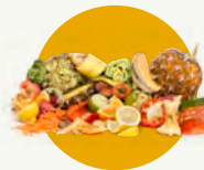
Food waste and food soiled paper.