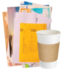
Paper & Paper Cups