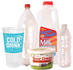
Plastic Bottles, Cups & Containers