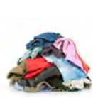
Clothing & Textiles