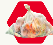
No plastic bags for food scraps — paper only, please.