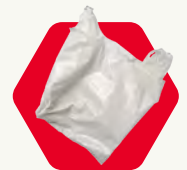
No loose plastic bags and no bagged recyclables.