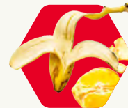
Keep food and liquid out of your recycling.