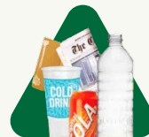
Recycle bottles, cans, cups, tubs, paper and cardboard