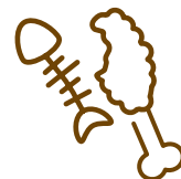
Food Scraps, Including Egg Shells, Meat & Bones