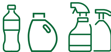
Empty Plastic Bottles, Rigid Plastic Containers, Plastic To-Go Containers (#6 not accepted)