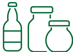
Glass Bottles & Jars (Even broken)