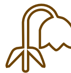
Grass, Weeds, Green Plants, Tree Limbs, Wood Chips, Dead Plants, Brush, Garden Trimmings, Leaves, Cut Flowers