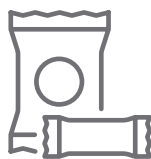
Snack & Chip Bags, Candy Wrappers & Con- diment Packages

Please use paper or ASTM D6400 rated compostable bags only to collect organics.