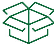
Paper Beverage Cartons, Clean Paper, Magazines, Newspaper, Junk Mail, Flattened Cardboard, Cereal Boxes