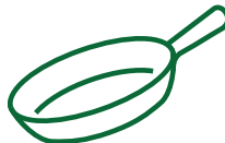
All Metal Beverage & Food Cans, Empty Aerosol Cans, Clean Aluminum Pans & Foil, Small Scrap Metal (Up To 20 Pounds)