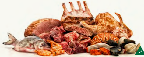
Meat (cooked or raw), Bones, Fish, Shellfish