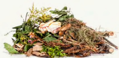
Yard Waste Grass Clippings, Leaves, Small Branches

Please place yard waste directly into the organics container. Ensure food scraps are placed in a plastic bag or paper bag before placing in your organics container.