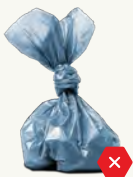
NO Pet Waste