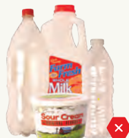
NO Plastic Bottles or Containers