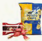
Candy, Snack & Food Wrappers