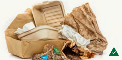
Food Soiled Paper, Coffee Filters, Tea Bags