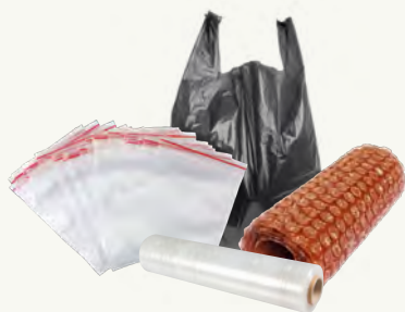
Bubble Wrap, Plastic Film & Plastic Bags