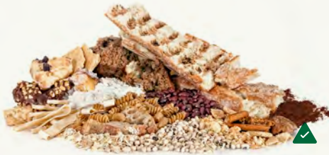
Bread, Pasta, Beans, Grains