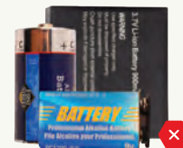
NO Hazardous Waste or Batteries