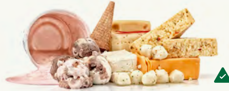
Eggs, Yogurt, Cheese, Sour Cream