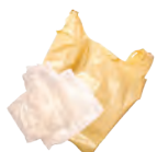
Plastic Bags & Film