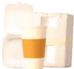
Foam Cups & Containers