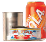
Food & Beverage Cans