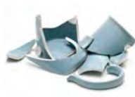
Broken Ceramic Dishes & Pots