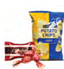
Candy, Snack & Food Wrappers