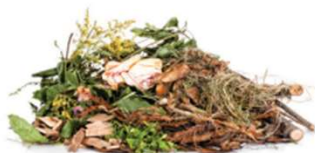
YARD WASTE Grass Clippings, Leaves, Small Branches