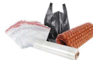
BUBBLE WRAP, PLASTIC FILM & PLASTIC BAGS