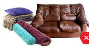
No Clothing, Furniture or Carpet