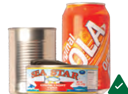
Food & Beverage Cans