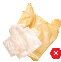
No Loose Plastic Bags, Recyclables in Plastic Bags, or Film Empty recyclables directly into your cart