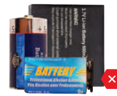
No Hazardous Waste or Batteries