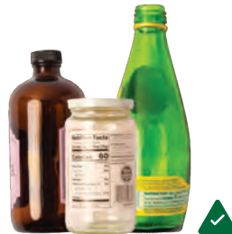
Glass Bottles & Containers