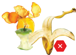
No Food or Liquids