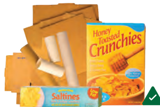
Flattened Cardboard & Paperboard