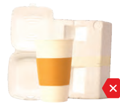
No Foam Cups & Containers