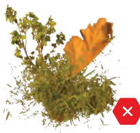
No Yard Waste