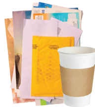
Paper & Paper Cups