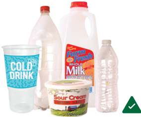
Plastic Bottles, Cups & Containers