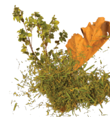
NO Green Waste

Empty recyclables directly into your bin