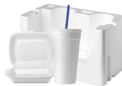
NO Foam Cups, Containers or Straws