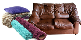
NO Clothing, Furniture or Carpet