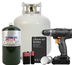
NO Batteries, Power Tools, Flammables or Hazardous Waste