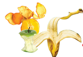
NO Food or Liquids