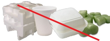
Foam Packaging, Cups & Containers