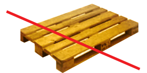
Pallets & Wood