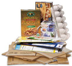
Paperboard & Cardboard