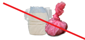
Diapers & Pet Waste