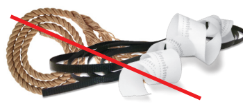
Cords, Wires, Rope