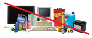
Electronics & Chemicals