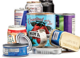
Empty Aluminum, Tin & Steel Cans