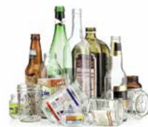
Glass Bottles, jars