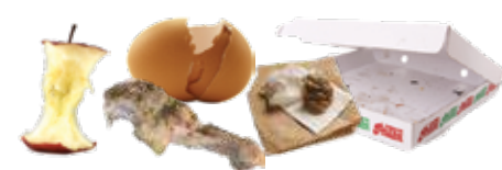
Food Waste & Food Soiled Paper