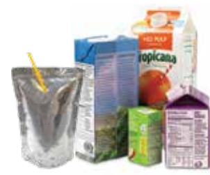
Juice Pouches/Boxes, Cartons (with plastic tops)

Do not place Household Hazardous Waste or electronic waste in the trash cart. For proper handling, please see the Household Hazardous Waste panel.