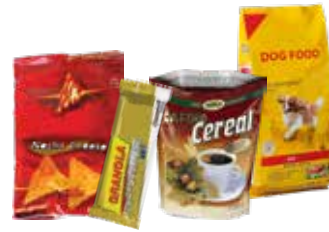
Food Wrappers, Pet food Bags