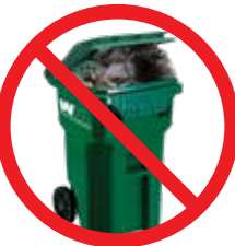
Do Not Overfill