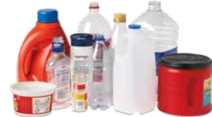
Plastic Bottles & Containers Bottles, jars, jugs & tubs

Unsure if an item is recyclable? When in doubt, leave it out of recycling.