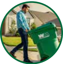
Set out carts at the curb on collection day by 7 a.m.