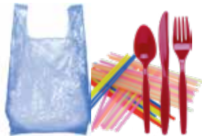
Plastic Bags, Straws & Utensils