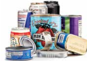
Food & Beverage Cans Tin, aluminum, steel food & beverage cans