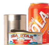
Metal Food & Beverage Cans