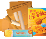
Flattened Cardboard & Paperboard