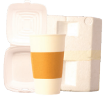
NO Foam Cups & Containers