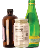
Glass Bottles & Containers