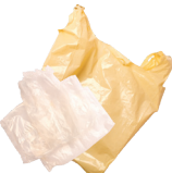
NO Loose Plastic Bags, Bagged Recyclables or Film Empty recyclables directly into your bin.