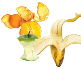
NO Food or Liquids