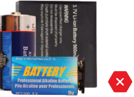
NO Batteries Check local drop-off programs for proper disposal