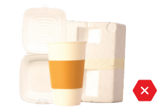
NO Foam Cups & Containers