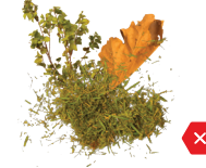
NO Green Waste