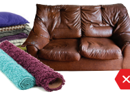
NO Clothing, Furniture & Carpet