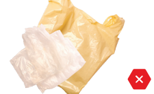
NO Loose Plastic Bags, Bagged Recyclables or Film Empty recyclables directly into your bin.