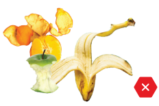
NO Food or Liquids