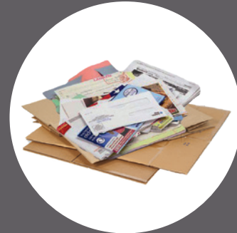
Clean paper & cardboard (please break down)