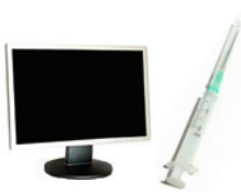
Hazardous waste (www.household-hazwaste.org)