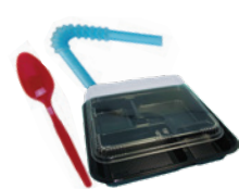
Utensils & straws, clam shells