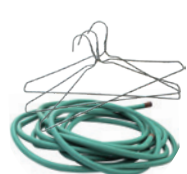
Hoses & wire