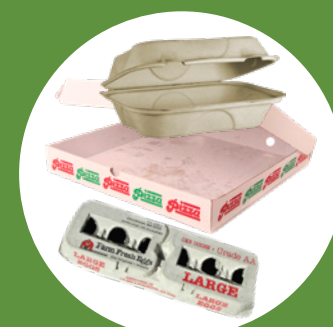
Uncoated paper take-out & pizza boxes, egg cartons