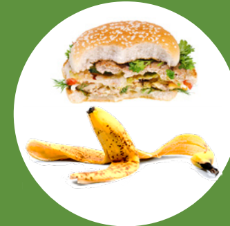
All food waste, peels, pits, & cores