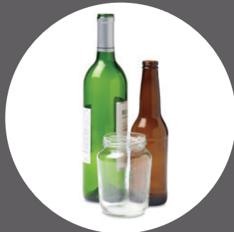
Glass bottles & jars