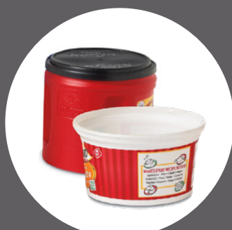
Rigid plastic containers