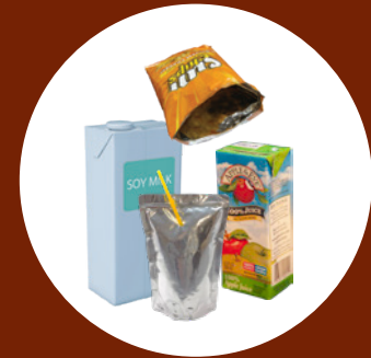
Drink & food cartons, boxes / pouches (Multi-material packaging)