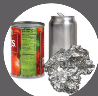
Cans, foil, & scrap metal