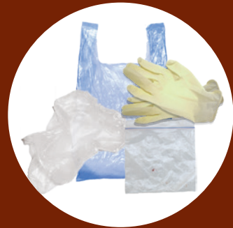
Loose plastic bags/wrap, disposable gloves