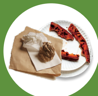
Uncoated food-soiled paper