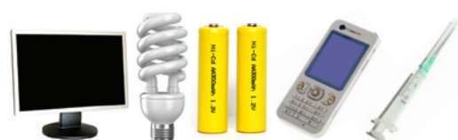
Hazardous waste (www.household-hazwaste.org)