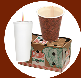
Coated paper products, waxed cardboard