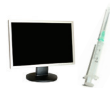
Hazardous waste (www.household-hazwaste.org)