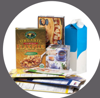
Paper packaging & paper cartons (empty)