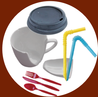
Broken glassware & ceramics, plastic straws, lids & utensils (Reusable items should be donated)