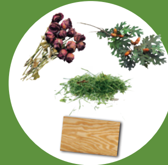
Plant debris & clean wood