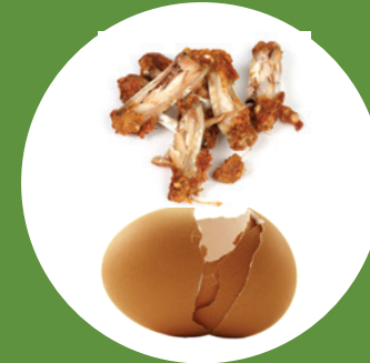
Bones & shells