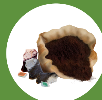
Coffee grounds & tea bags