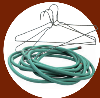
Hoses & wires