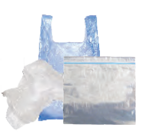
Plastic Wrap, Bags & Other Plastic Film