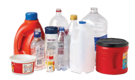
Empty Plastic Bottles, Rigid Plastic Containers (Lids should be left on or placed in trash)

Have a question about where you can recycle an item? Check out www.resource.stopwaste.org or call Stopwaste's Recycle Hotline at 1-877-STOPWASTE.