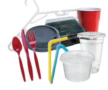
Plastic Cups & Lids, Utensils, Straws, Clam Shells, Deli Containers & Hangers (Including "compostable" plastic serveware)