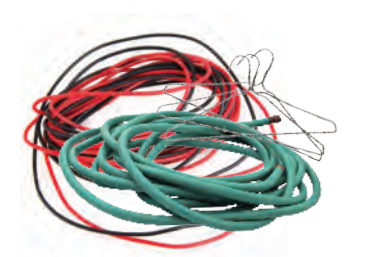
Hoses, Cords & Wire (Electrical wires are e-waste. Refer to Hazardous Waste Disposal Information)