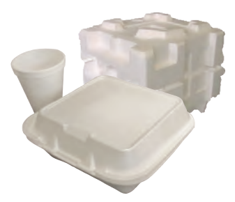
Polystyrene Foam & Packaging