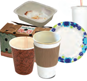
Coated Paper Cups/Plates, To Go Containers, Wax-lined Food Cardboard Boxes