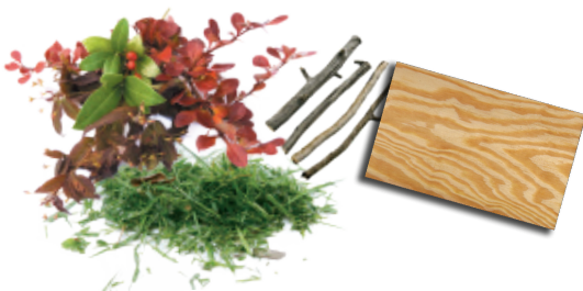
Yard Waste, Untreated Wood