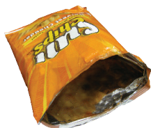
Snack & Chip Bags, Candy Wrappers

Coated paper (with surface sheen) such as cups, plates or cardboard boxes, belong in trash only. (Paper beverage cartons may go into recycling)