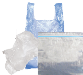
Plastic Wrap, Bags & Other Plastic Film