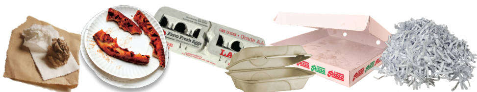
Food Soiled Paper, Napkins, Paper Towels, Pizza Boxes, Cardboard Egg Cartons, Non-coated Take-out Containers & Paper Plates (No surface sheen), Shredded Paper