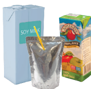
Asceptic (Mixed Material) Drink & Beverage Cartons, Boxes & Drink Pouches