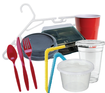
Plastic Cups & Lids, Utensils, Straws, Clam Shells, Deli Containers & Hangers (Including "compostable" plastic serveware)