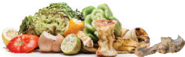
Food Scraps, Including Egg Shells, Meat & Bones

No coated paper (with surface sheen) such as cups, plates or cardboard boxes. No "compostable" plastics.