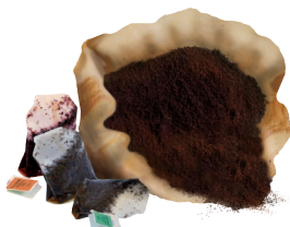
Coffee Grounds & Tea Bags