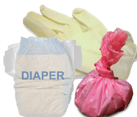
Diapers, Pet Waste, Disposable Gloves