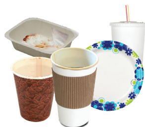
Coated Paper Cups/Plates & To Go Containers