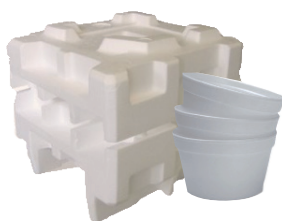
Polystyrene Foam & Packaging