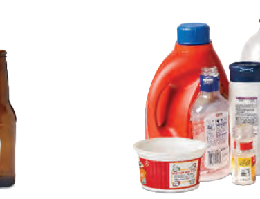
Empty Plastic Bottles, Rigid Plastic Containers (Lids should be left on or placed in trash)

Have a question about where you can recycle an item? Check out www.resource.stopwaste.org or call Stopwaste's Recycle Hotline at 1-877-STOPWASTE.