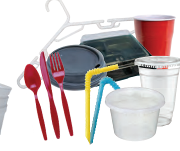
Plastic Cup Lids, Utensils, Straws, Clam Shells, Deli Containers & Hangers (Including "compostable" plastic serveware)