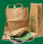
Paper & plastic