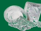
Clean aluminum foil & tray