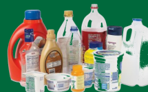
Plastic bottles & containers