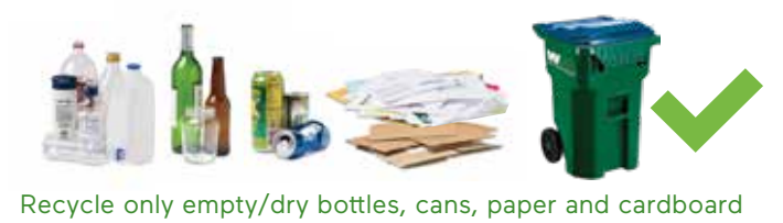
Recycle only empty/dry bottles, cans, paper and cardboard