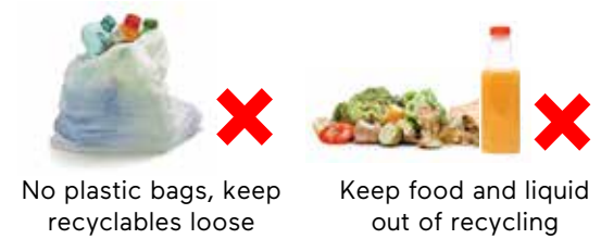
No plastic bags, keep recyclables loose