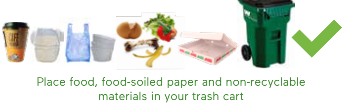
Place food, food-soiled paper and non-recyclable materials in your trash cart