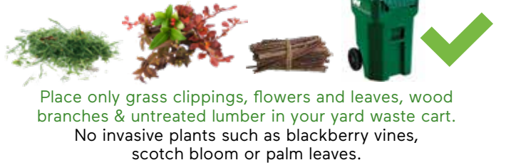
Place only grass clippings, flowers and leaves, wood branches & untreated lumber in your yard waste cart. No invasive plants such as blackberry vines, scotch bloom or palm leaves.