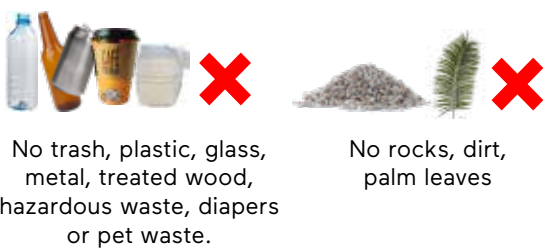
No trash, plastic, glass, metal, treated wood, hazardous waste, diapers or pet waste.