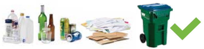
Recycle only empty/dry bottles, cans, paper and cardboard