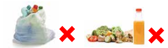
No plastic bags, keep recyclables loose Keep food and liquid out of recycling