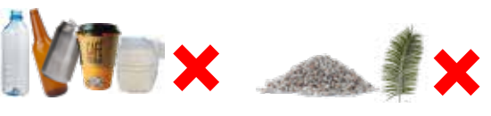
No trash, plastic, glass, metal, treated wood, hazardous waste, diapers or pet waste. No rocks, dirt, palm leaves