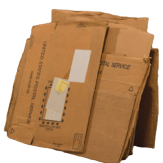
E) Cardboard Boxes (Always Breakdown)

A. Recycling B. Trash C. Trash D. Trash E. Recycling