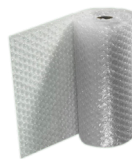
D) Bubble Wrap and Packaging Air Bags