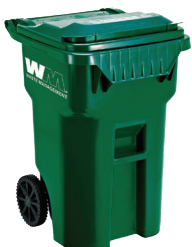
C: Green Waste