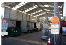
D: Household Hazardous Waste