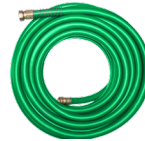
E) Hoses, Rope. String of Lights

A) Placed on top of your recycling cart in a zip lock bag on your regular collection day. B) Trash (C) Donate or Trash D) Trash E) Trash