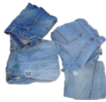
C) Torn Clothes