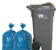
Waste Small – 35-gallon cart 39x20x23