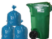
Greens Medium – 64-gallon cart 41.6x26.7x28