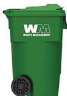
96-gallon green waste