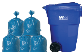
Recycle Large – 96-gallon cart 45.7x28.5x33.7