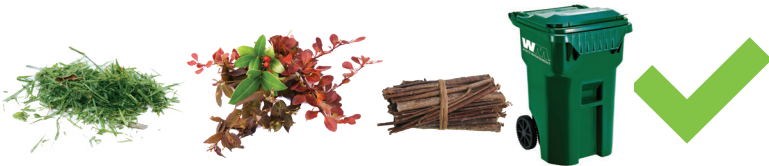
Place only grass clippings, flowers and leaves, wood branches & untreated lumber in your yard waste cart.