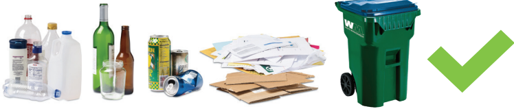
Recycle only empty/dry bottles, cans, paper and cardboard