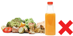
Keep food and liquid out of recycling