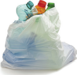
No plastic bags, keep recyclables loose