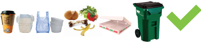
Place food, food-soiled paper and non-recyclable materials in your trash cart