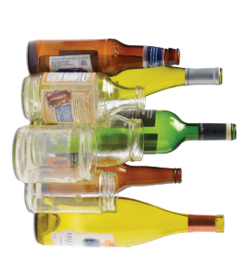
Empty Glass Bottles & Jars