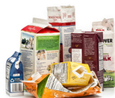
Food & Beverage Cartons