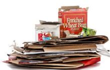
Flattened Cardboard & Paperboard