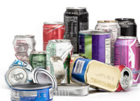
Food & Beverage Cans