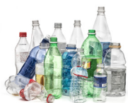
Plastic Bottles & Containers