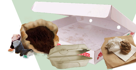
Pizza Boxes & Food-Soiled Paper, Napkins, Paper Towels, Coffee Grounds, Tea Bags