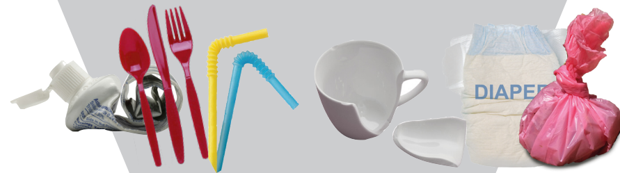
Plastic Utensils, Plastic Straws Broken Glass & Dishes Diapers & Pet Waste