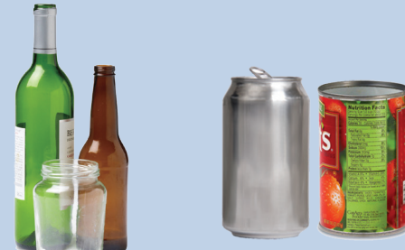
Empty Glass Bottles & Jars, All Metal Beverage & Food Cans