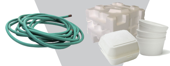
Hoses, Cords & Wire, Polystyrene Foam & Packaging