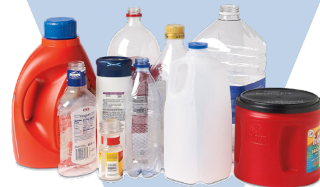
Empty Plastic Bottles & Containers

No plastic bags. Please do not bag recyclables, keep loose.