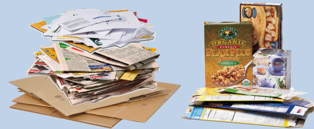
Clean Paper, Magazines, Newspaper, Junk Mail, Cardboard, Cardboard Egg Cartons, Cereal Boxes