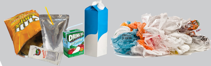
Snack & Chip Bags, Drink Pouches & Boxes, Wrappers, Plastic Wrap, Bags & Other Film Plastic