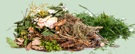
Grass, Weeds, Plants, Tree Limbs, Wood Chips, Dead Plants, Brush, Garden Trimmings, Leaves, Cut Flowers (Please place palm fronds, yucca and cacti in the Trash)