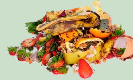
Food Scraps, Including Egg Shells, Meat & Bones