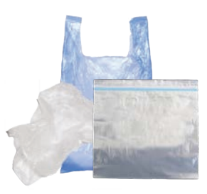
Plastic Wrap, Bags & Other Plastic Film