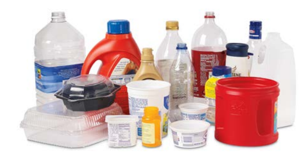
Empty Plastic Bottles, Rigid Plastic Containers, Plastic To-Go Containers