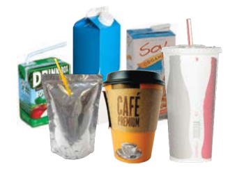
To-Go Coffee & Soda Cups Drink & Beverage Pouches Gable Top & Aseptic Cartons