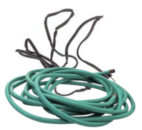
Hoses, Cords & Wire