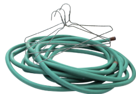
Hoses, Cords & Wire