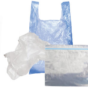
Plastic Wrap, Bags & Other Plastic Film