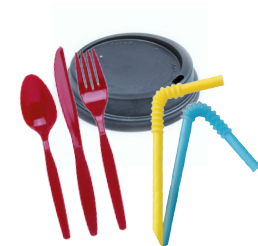
Cup Lids, Plastic Utensils, Plastic Straws (Including items marked compostable)