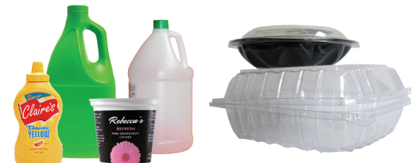
Empty Plastic Bottles, Rigid Plastic Containers