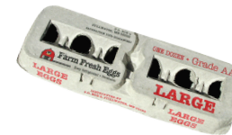
Cardboard Egg Cartons