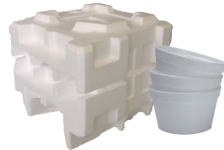
Polystyrene Foam & Packaging