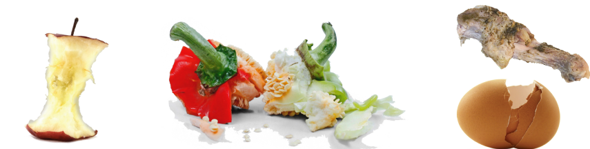
Food Scraps, Including Egg Shells, Meat & Bones