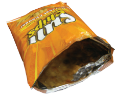
Snack & Chip Bags, Candy Wrappers