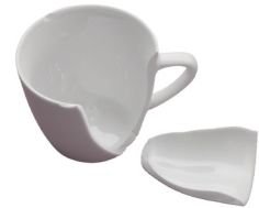
Broken Glass & Dishes (Please Wrap)