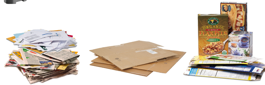
Clean Paper, Magazines, Newspaper, Cardboard, Junk Mail

Please empty all containers prior to recycling.