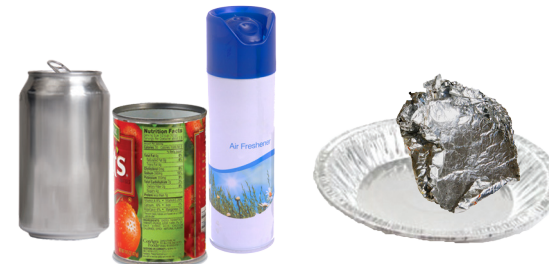
All Metal Beverage & Food Cans, Aerosol Cans, Clean Aluminum Pans & Foil