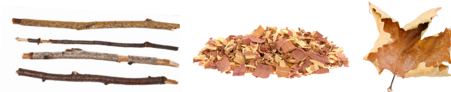
Grass, Weeds, Green plants, Tree limbs, Wood chips, Dead plants, Brush, Garden trimmings, Leaves Holiday trees should be cut into small pieces and placed into yard waste cart.