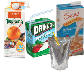
Drink & Beverage Boxes / Pouches (Multi-material Packaging)