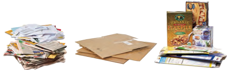
Clean Paper, Magazines, Newspaper, Cardboard, Junk Mail