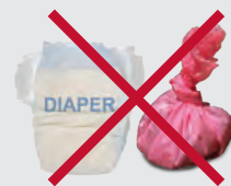
Diapers & Pet Waste