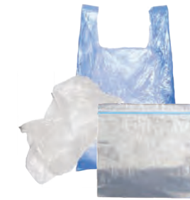
Plastic Wrap, Bags & Other Plastic Film