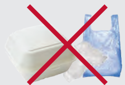
Plastic Wrap, Bags & Polystyrene Foam