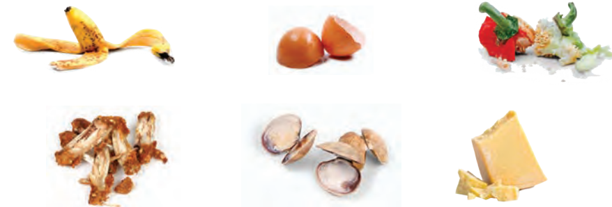
Food Scraps, including Fruits, Vegetables, Egg Shells, Meat, Bones, Shellfish and Cheese