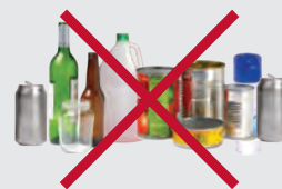
Glass, Metal & Plastic Containers