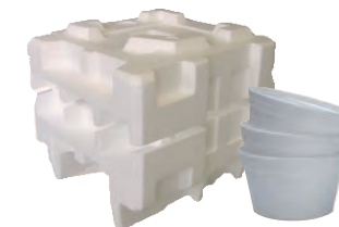
Polystyrene Foam & Packaging