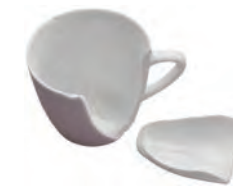
Broken Glass & Dishes