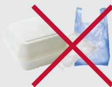
Plastic Wrap, Bags & Polystyrene Foam