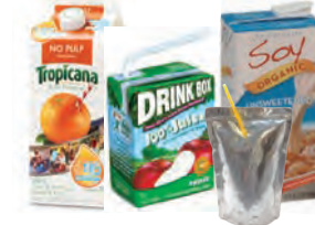
Drink & Beverage Boxes / Pouches (Multi-material Packaging)