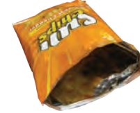
Snack & Chip Bags, Candy Wrappers