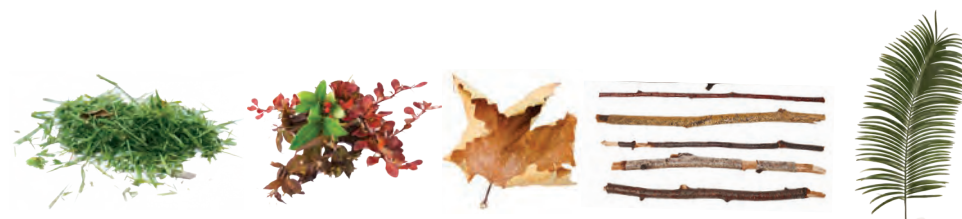
Grass, Weeds, Green Plants, Tree Limbs, Wood Chips, Untreated Wood, Dead Plants, Brush, Garden Trimmings, Leaves and Palm Fronds