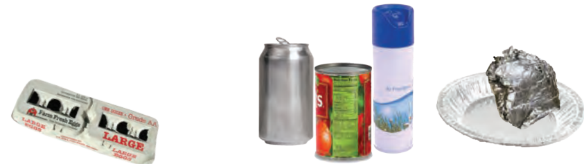
Cardboard Egg Cartons