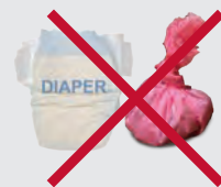
Diapers & Pet Waste