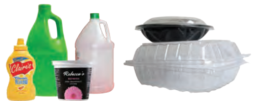
Empty Plastic Bottles, Rigid Plastic Containers