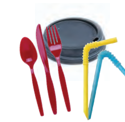
Cup Lids, Plastic Utensils, Plastic Straws