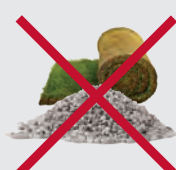
Sod, Rocks, Gravel & Dirt