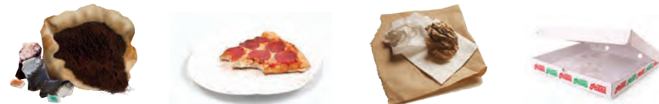
Food-Soiled Paper, including Paper Towels, Napkins, Milk Cartons Paper Containers, Paper Cups, Tea Bags, Coffee Filters and Greasy Pizza Boxes