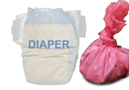
Diapers & Pet Waste