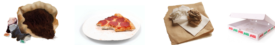
Food-Soiled Paper, including Paper Towels, Napkins, Milk Cartons Paper Containers, Paper Cups, Tea Bags, Coffee Filters and Greasy Pizza Boxes