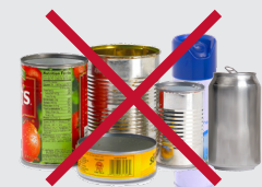
All Metal Beverage, Food Cans & Aerosol Cans