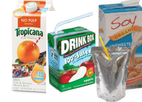
Drink & Beverage Boxes / Pouches (Multi-material Packaging)