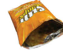
Snack & Chip Bags, Candy Wrappers