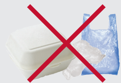
Plastic Wrap, Bags & Polystyrene Foam