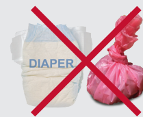
Diapers & Pet Waste