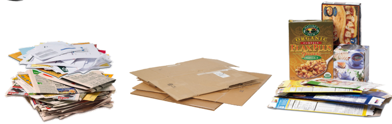
Clean Paper, Magazines, Newspaper, Cardboard, Junk Mail