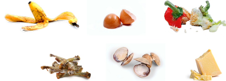
Food Scraps, including Fruits, Vegetables, Egg Shells, Meat, Bones, Shellfish and Cheese