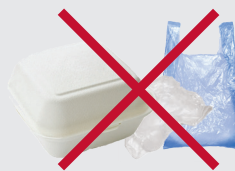
Plastic Wrap, Bags & Polystyrene Foam