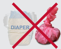
Diapers & Pet Waste