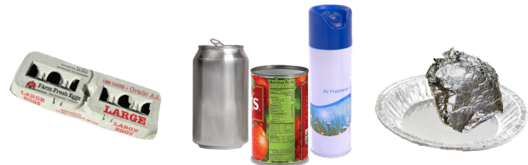
Cardboard Egg Cartons All Metal Beverage & Food Cans, Empty Aerosol Cans, Clean Aluminum Pans & Foil