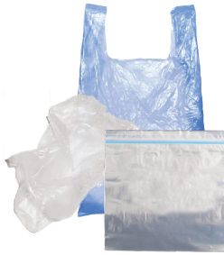
Plastic Wrap, Bags & Other Plastic Film