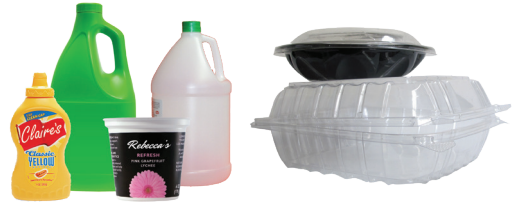
Empty Plastic Bottles, Rigid Plastic Containers