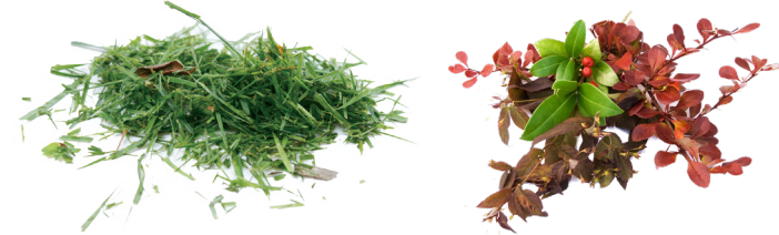
Grass, Weeds, Green Plants, Tree Limbs, Wood Chips, Untreated Wood, Dead Plants, Brush, Garden Trimmings, Leaves and Palm Fronds