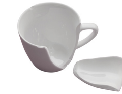
Broken Glass & Dishes