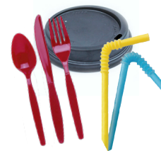
Cup Lids, Plastic Utensils, Plastic Straws