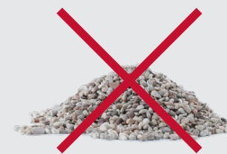
Rocks, Gravel & Dirt