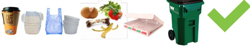
Place food, food-soiled paper and non-recyclable materials in your trash cart