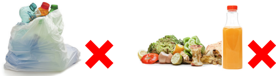
No plastic bags, keep recyclables loose Keep food and liquid out of recycling