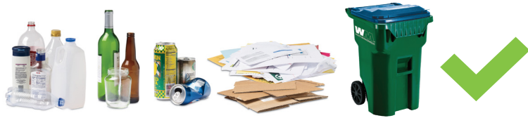
Recycle only empty/dry bottles, cans, paper and cardboard

Please follow the guidelines to the right for what goes into a cart, and what does not belong.