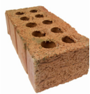
No construction materials