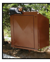
Baker Bear Bins (530) 587 1374 bakerbin.com