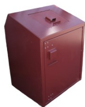
Tahoe Bear Box Company (530) 546 3154 bearbox.org

Bear sheds are available for purchase from several vendors locally. IVGID does not endorse any particular manufacturer.