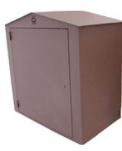
Carson Valley Welding (775) 884 9353 nobearcan.com