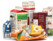
Food & Beverage Cartons